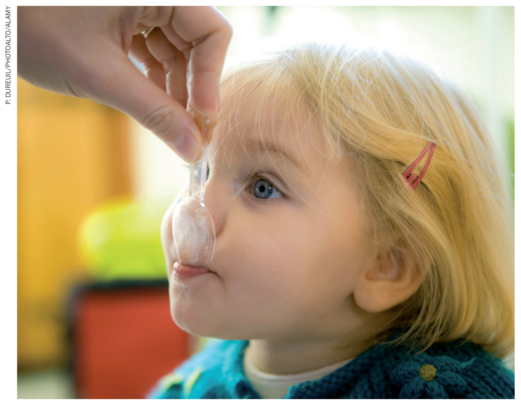
Dosed up: could excessive prescription of antibiotics be hampering children's ability to fight disease?

OBITUARY Jonathan Widom, genomic map-maker, remembered p.400